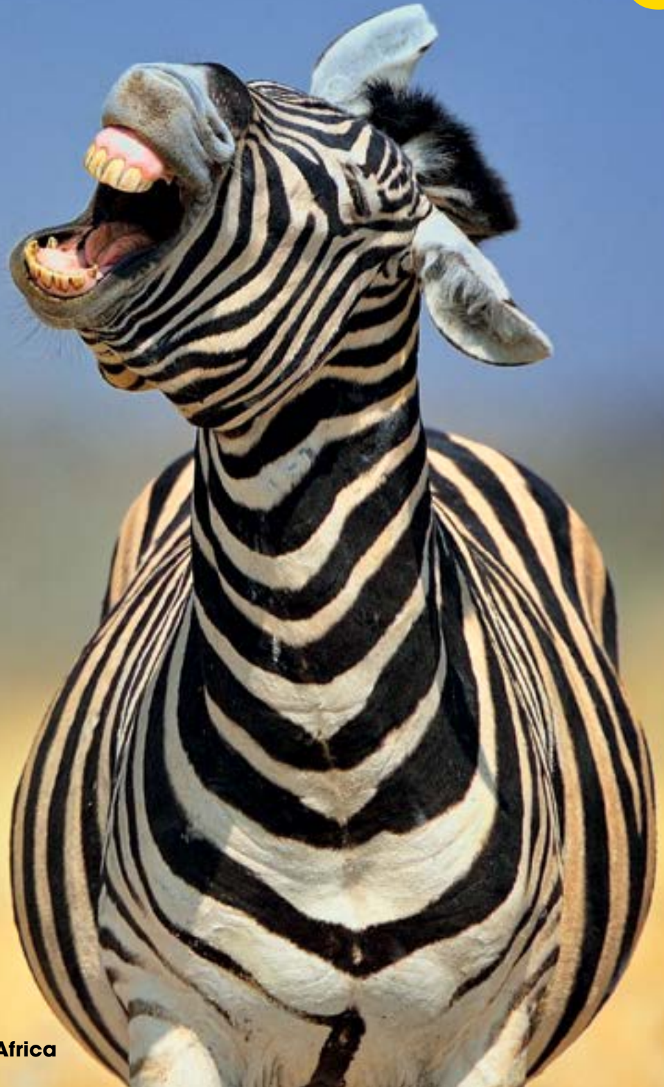
A zebra in Africa

Look at the photo. Answer the questions.